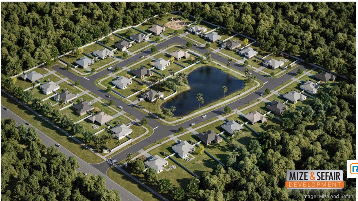
An aerial rendering shows plans for Mia Bella, a 30-unit built-to-rent community in the works for Palmetto.